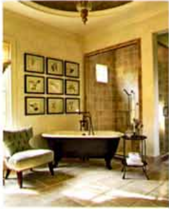
The Inspiration: Designer Kelly Welsh, Houston

We love the natural look of this bath. The rich color, the art collection, and the much-needed side table for a freestanding tub bring it all together. What makes it succeed is the melding of natural materials with luxurious details.