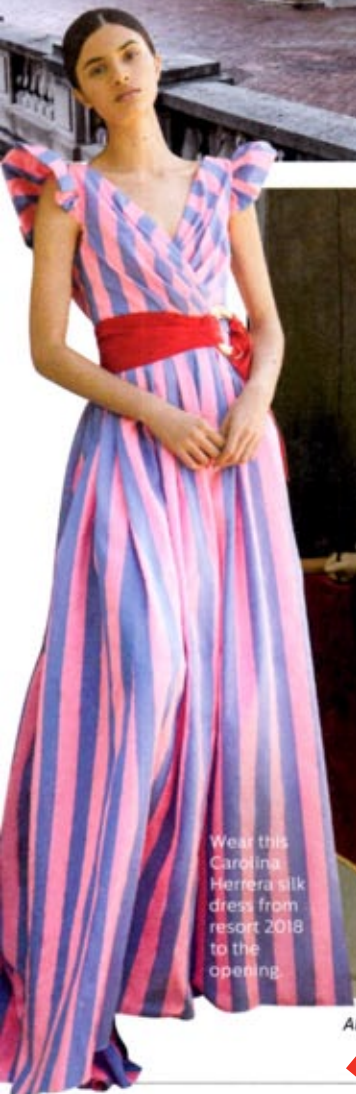
Wear this Carolina Herrera silk dress from resort 2018 to the opening.