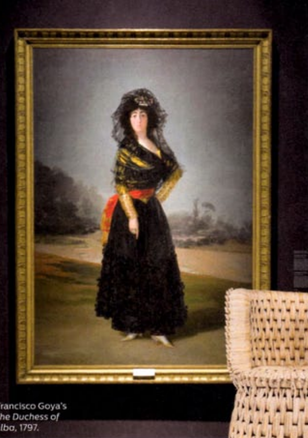
Francisco Goya's The Duchess of Alba , 1797.

Handcrafted metal furniture and lighting fixtures range from magnolia-shaped sconces to Deco benches and consoles. avrett.com