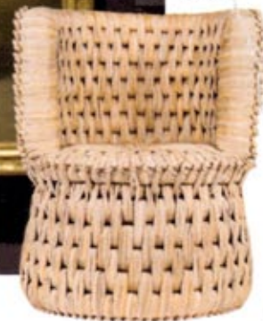
TXT.03 woven-seagrass chair.