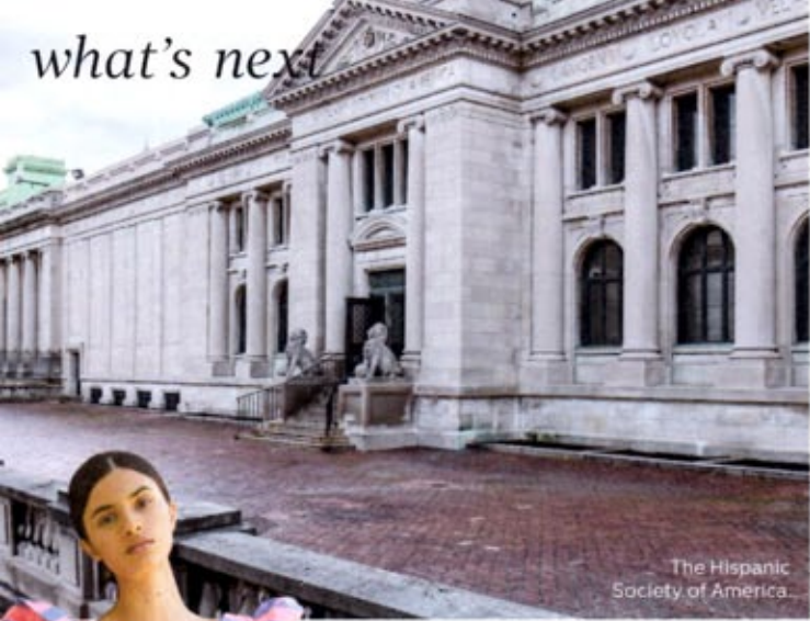
The Hispanic Society of America